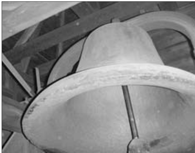
The Freedman's Bell now resonates in the bell tower above the sanctuary at First Christian Church of Berea.